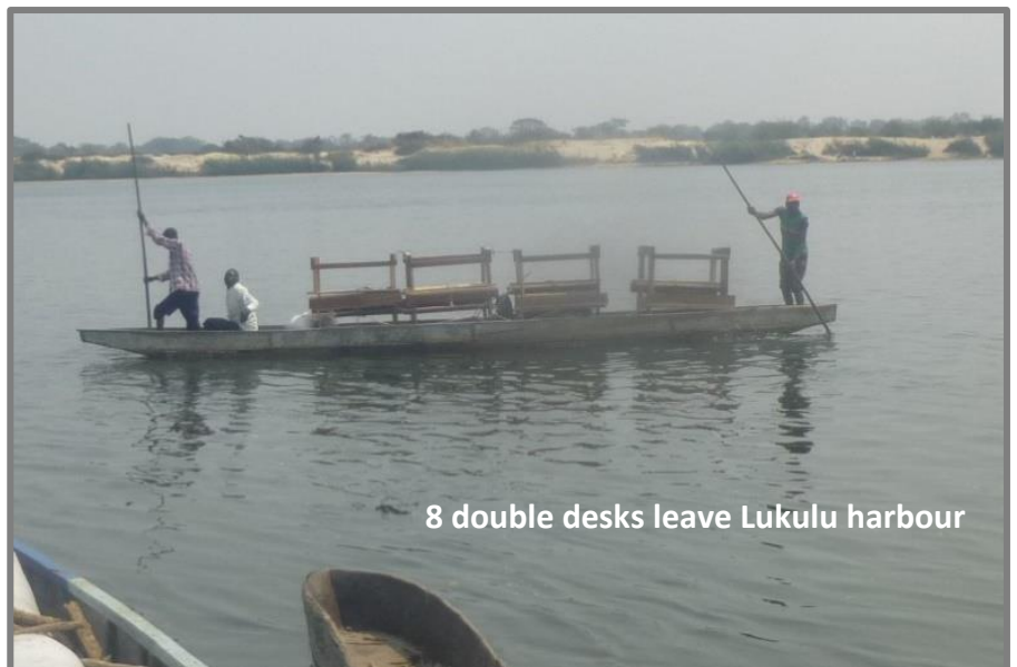
8 double desks leave Lukulu harbour

Given that in many cases there is no mobile network or the teachers do not have phones, the logistics