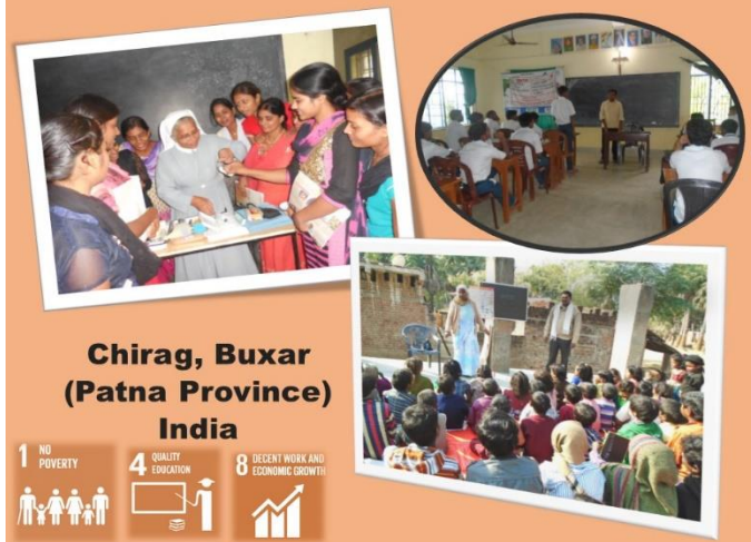
Chirag, Buxar (Patna Province) India

Sisters at Chirag, Buxar work to ensure that no one is left behind. They run 30 supplementary Education centers in 15 villages. Girls are trained as General Duty Assistants (GDA). They are taught elementary nursing so that they can take care of the sick and old people. After the training they work as home nurses or in clinics as helpers pursuing further studies while they work. Boys are trained in Electricals. Under the Bihar Skill Development Mission youths are given training in computer skills.