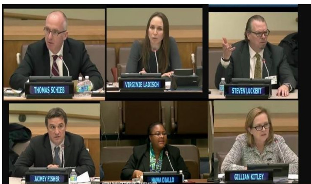
Holocaust Remembrance: Educating Against Extremism, Building a Better Future

“Educating against Extremism, Building a Better Future” was the title of the DPI Briefing for Holocaust Remembrance. We do not often think how the formal education system and non-formal education can be used to instill intolerance, racism and a narrative that can lead the extermination of millions of countrymen and women. We heard how it was possible, in a few years, to manipulate most of the population with specific language, images, media and entertainment. Focusing on a specific group, isolating and demonizing that group, utilizing communications skills were part of the culture created that led to the Holocaust. We also noted that the same tactics continue to be used. The central importance of education in critical thinking, in recognizing misleading information and in educating in tolerance and respect were stressed by the speakers.