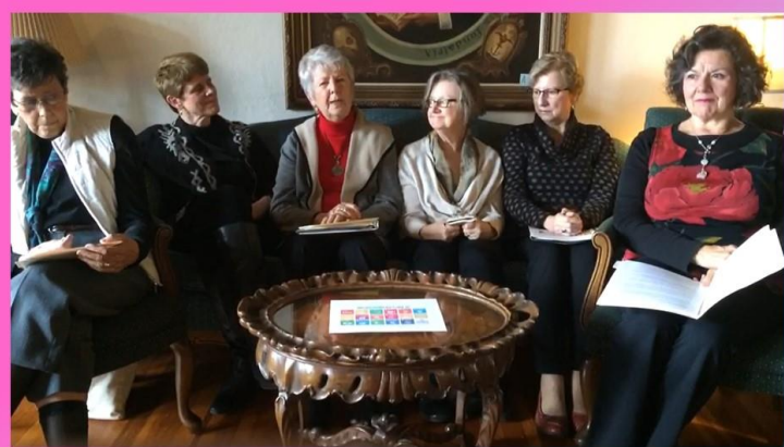
Spiritual Direction, Spiritual Development and the 2030 Sustainable Development Agenda