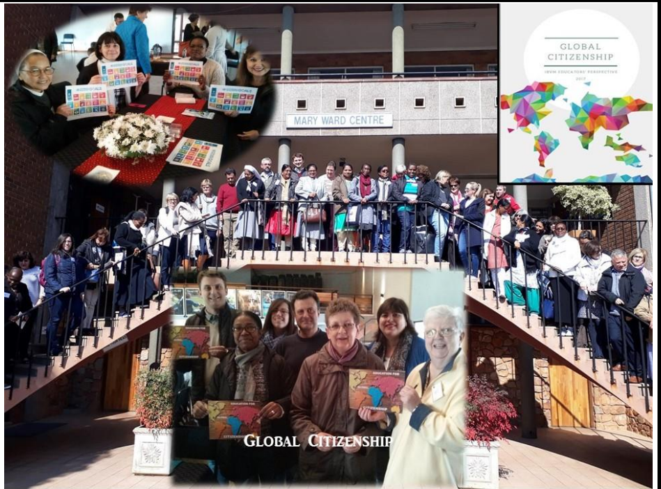
Education Conference South Africa

essential to educate young people in awareness. Empathy, compassion, reflection and action were seen as essential requisites for global citizens. Read the document Global Citizenship: IBVM Educators’ Perspective .