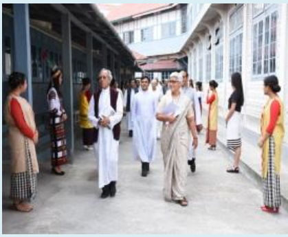
The back of the building leading out to the basketball courts.