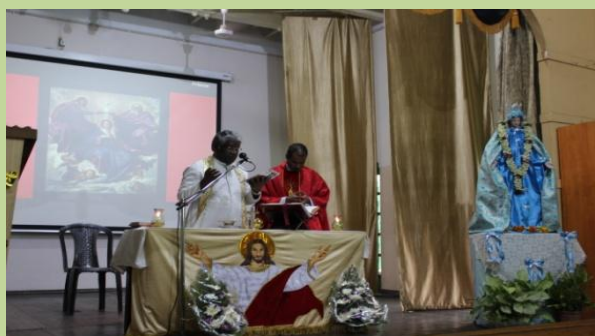
Crowning of Our Lady

On 30 th April, the support staff of Loreto Dharamtala was honoured and given tokens of appreciation.