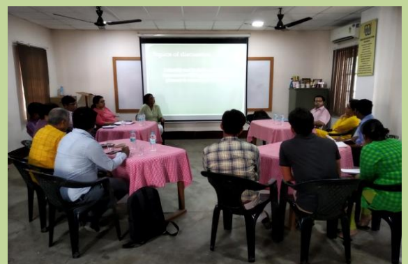
Networking at the Destination Location-Kolkata