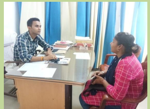
Networking at the Source Location-Nawada, Bihar