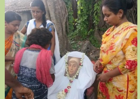
5 years celebration at the projects area